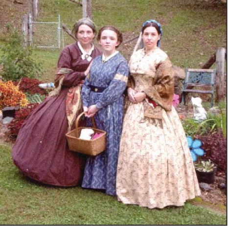
"Daughters of the Confederates"