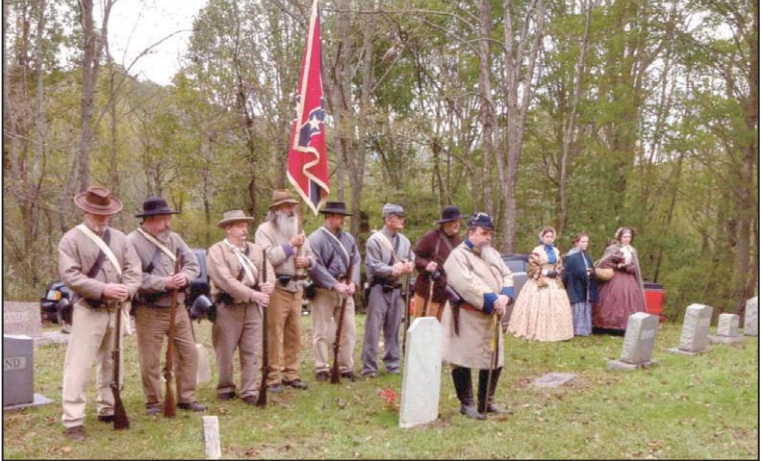
"Sons of the Confederates"