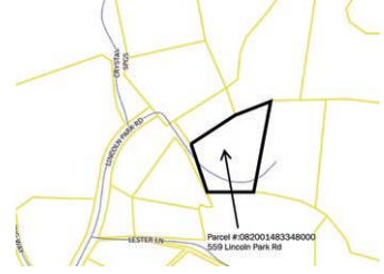
Published October 11, 18, 2023.