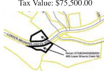
Published November 15, 22, 2023