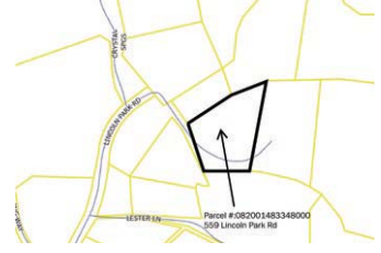
Published February 28, March 6, 2024.