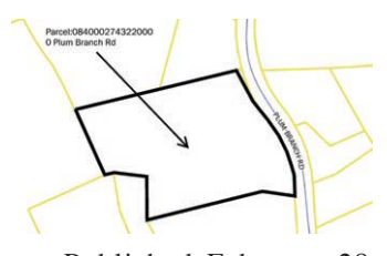
Published February 28, March 6, 2024