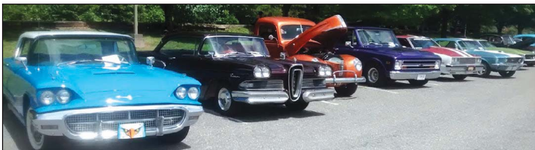
Pictured above are some of the antique vehicles featured in last year's show.