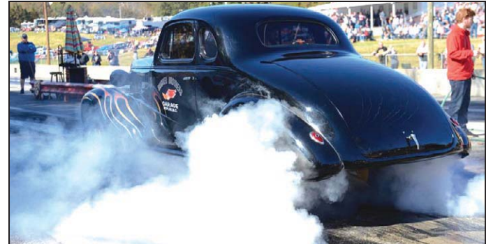
Along with some nail-biting drag action, spectators can enjoy a car show and swap meet during the event at Wilkesboro Dragway.

The car club's annual Run for the Hills Car Show is set for August 31 in Poplar, NC.