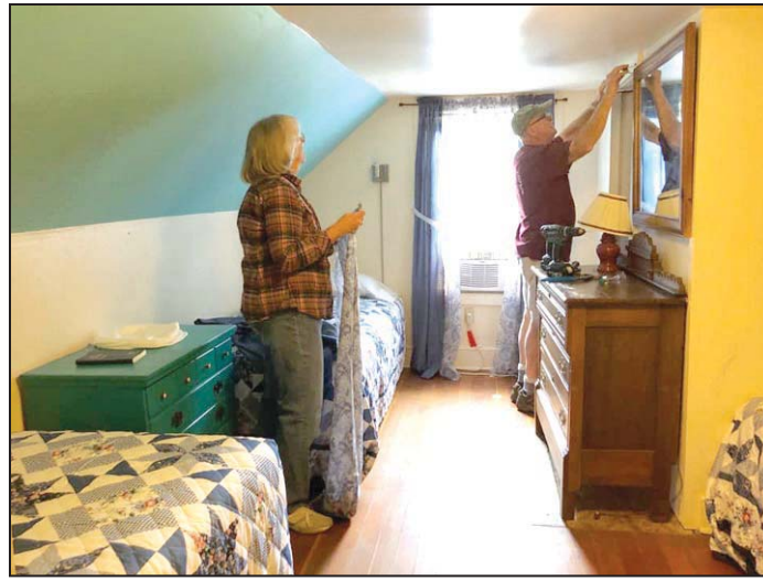
Volunteers did handy work the Family Violence Coalition's Shelter for victims of domestic violence.