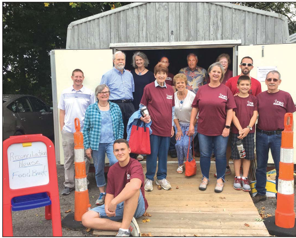
Volunteers from First Baptist Church took church to the streets and spent time helping distribute food for Reconciliation House's food bank among other projects.

Sept. 11 – Pinto beans, mixed greens, macaroni and cheese, cornbread, pears and orange juice.