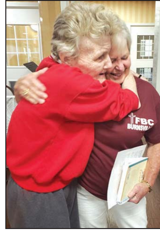
Church members spent time visiting with residents of Mountain Manor and Yancey House.