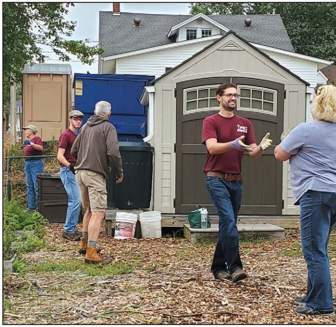
Volunteers worked in the church's Seeds of Hope Community Garden that provides fresh produce to people who are food insecure.

For more information on services and all the activities happening at First Baptist Church, please contact the church office at 682-2288 or by email at mail@fbcburnsville.com.